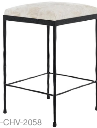
5300-CHV-2058 Dusty Cream Hide