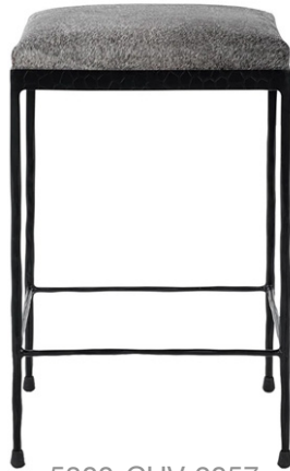
5300-CHV-2057 Sparrow Gray Hide