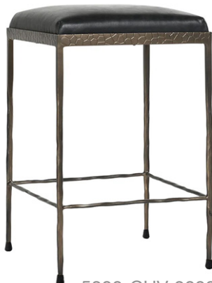
5300-CHV-2008 Onyx Black Leather