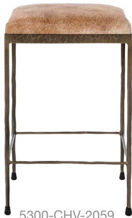
5300-CHV-2059 Canyon Sand Hide