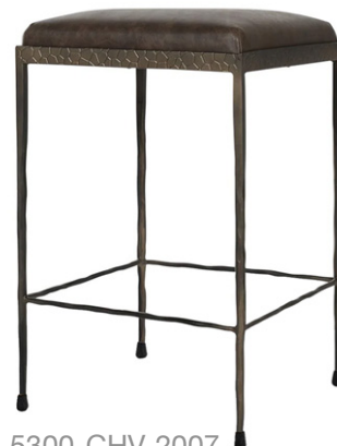
5300-CHV-2007 Cocoa Brown Leather