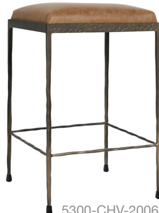
5300-CHV-2006 Sedona Brown Leather