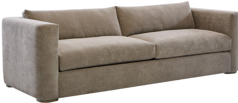
Loose Back, Standard Comfort Foam Cushion Sofa Standard Sofa W103" x D40" x H37" 645-YNG-30