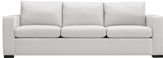
Large Front Rail + Wenge 2" Leg 3 over 3 Cushions + Wide Track Arm

Overall Height 32" | Seat Height 18" | Seat Depth 22"