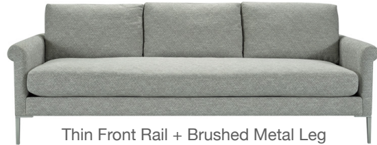
Thin Front Rail + Brushed Metal Leg 3 over Bench Seat + Roll Arm