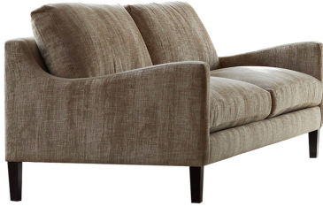
Thin Front Rail + Tall Wood Leg 2 over 2 Cushions + Down Slope Arm