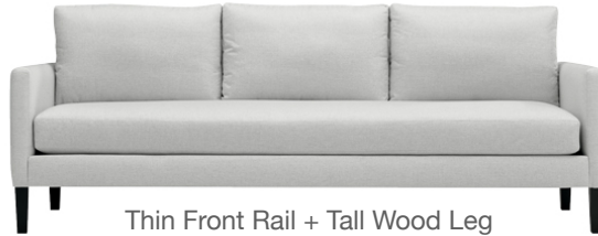
Thin Front Rail + Tall Wood Leg 3 over Bench Seat + Track Arm