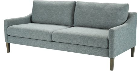
Thin Front Rail + Tall Wood Leg 2 over 2 Cushions + Up Slope Arm