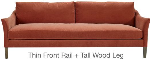
Thin Front Rail + Tall Wood Leg 2 over Bench Seat + Flair Arm