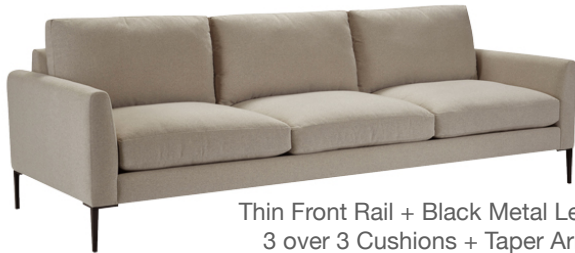
Thin Front Rail + Black Metal Leg 3 over 3 Cushions + Taper Arm