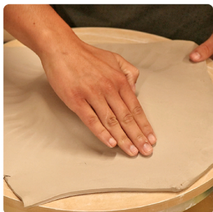
9. Gently mold your clay around your form.