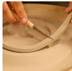
12. Remove foot ring and add to the top without scoring.