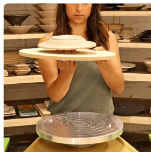
15. Lift WA from wheel, press center space from bottom.