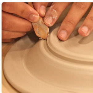
14. Use modeling tool to clean up any excess clay.