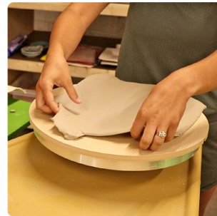
4. Transfer your rolled slab onto the WA Board.