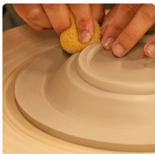
13. Shape and trim foot ring and lip with a damp sponge.