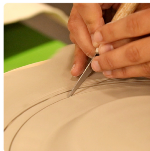
11. Use knife to cut the lip and to cut a foot ring.