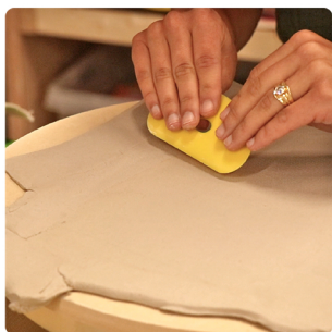
5. Compress your slab on WA Board with rib tool.