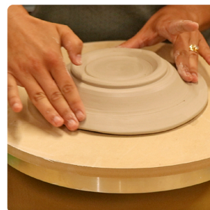
16. Transfer form back to WA board and shape your lip.