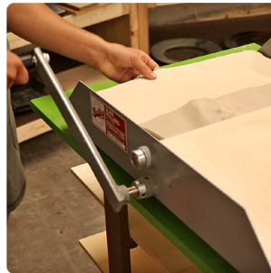
3. Roll out your slab of clay.