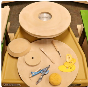
1. Gather the necessary tools.