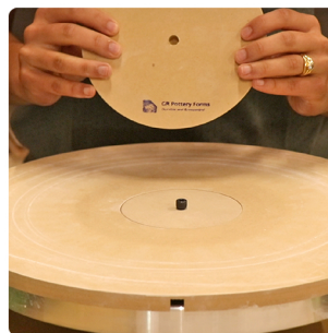
7. Place WA Spacer, Pin and round form on Master.