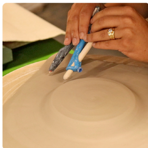
10. Use Sue Tool to mark clay with desired lip width.