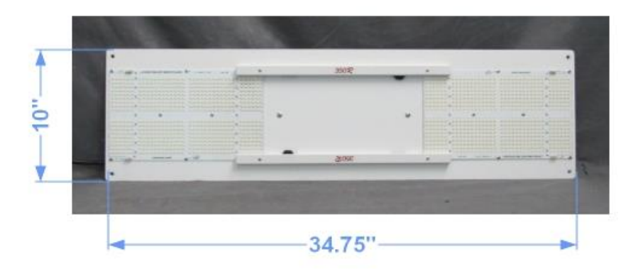
FIG. 1 LUMINAIRE