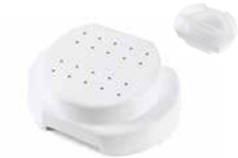
Replacement Stabiliser Basket Part Id C2 041921