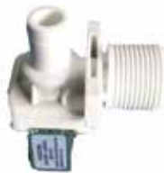
Water Inlet Valve Part Id 16 041912