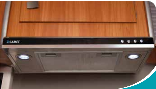
Camec 12V Stainless Steel Range Hood