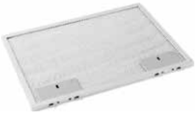
Replacement Filter Removable To Suit Camec 12 Volt Range Hood - refer code 040864