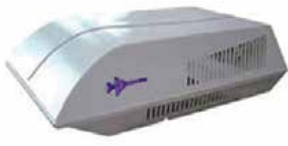
Cormorant Reverse Cycle Air Conditioner - 5750001/5702007

The Cormorant is one of the highest capacity Caravan/ RV air conditioner on the market with 3.5kW cooling and heating, suitable for up to 23 feet vans.