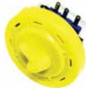
Replacement/Spare Water Level Sensor 041908