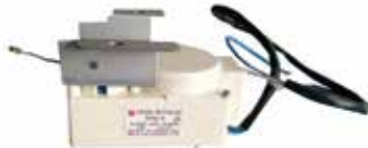
Mode Switch Part Id 55 T 041911