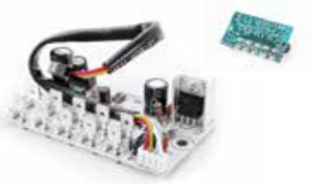
Replacement Circuit Board To Suit Camec 12 Volt Range Hood - refer code 040864

Replacement circuit board for Camec 12 Volt Range hood - 040864