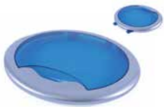
Replacement/Spare Lid Including Magnet 041922