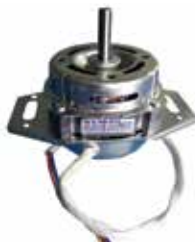
Motor Part Id 68 041909