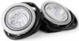
Replacement Led Down Light Long Lead To Suit Camec 12 Volt Range hood - refer to code 040864

Led Down Light Long Lead To Suit Camec 12 Volt Range Hood 040864 each