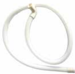
Drain Hose Part Id 89 042798