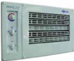
Heron 2.2 Split System Air Conditioner Series 3 White - 4270001

The Heron 2.2 is a compact, efficient split system air conditioner that allows great flexibility of installation