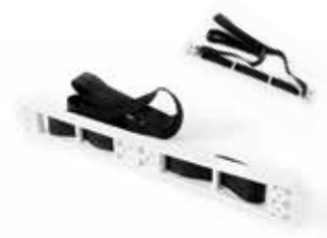
Replacment/Spare Mounting Bracket Part ID C1 041920