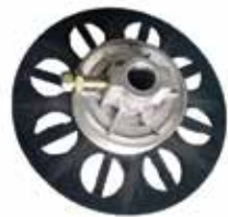
Motor Pulley Part Id 66 041919