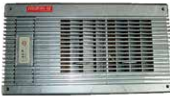
Heron Q MK4 Split System Air Conditioner Silver - 4810002

The Heron Q is a compact, efficient reverse cycle split system air conditioner that allows great flexibility of installation.