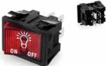
Range Hood Switch - Red Fan Logo (Suits Globe Range Hood)

R-HOOD SW RED LIGHT LOGO R-HOOD SW - RED FAN LOGO