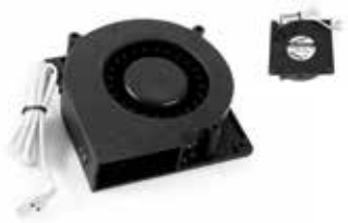
Replacement Fan To Suit Camec 12 Volt Range hood - refer code 040864

Replacement fan to suit Came 12 Volt range hood. - refer code 040864