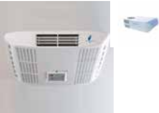
Sparrow Reverse Cycle Air Conditioner - 5850001+5852006

The Sparrow reverse cycle heat pump roof top air conditioner is a lightweight rooftop style unit.