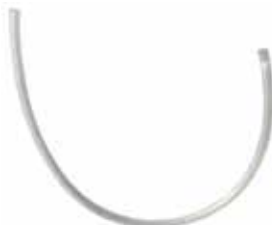
Air Trap Hose Part Id 9 041918