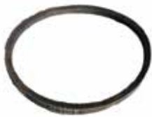
V-Belt Part Id 65 041914