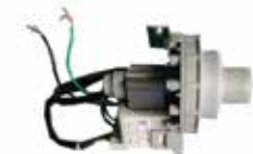
Drain Pump Part Id 91 041913