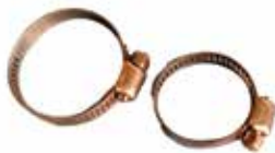
Hose Clamp Part Id 94 042796