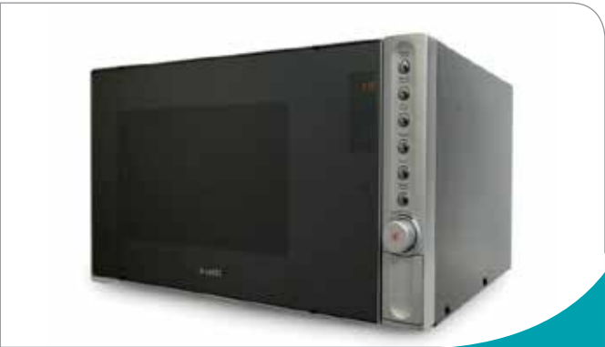
Camec 25L Microwave