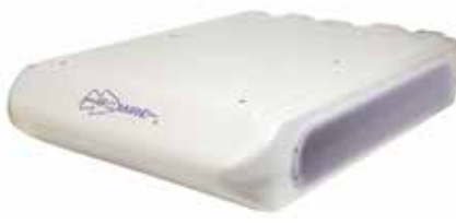
Ibis Reverse Cycle Air Conditioner - 8000002+8003006

The Ibis is the lowest profile fully reverse cycle roof top air conditioner