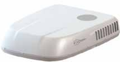
Ibis 3 R/C Air Conditioner (New model 2014)

The Ibis 3 has new enhancements - including higher capacity heating & cooling. It is stylish, ultra low profile, and super quiet. Ideal for RV vehicles.