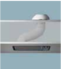
Electrolux Flush Mount Range Hood 12 Volt CK150