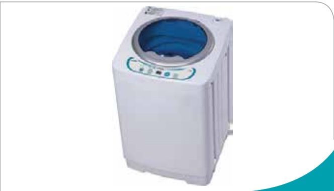
Camec Compact RV 2.5kg Top Load Washing Machine

Of course we also supply many other brands, such as Dometic, Air Command, Denso, Smev and Engel so we can cater for nearly any product you may need.