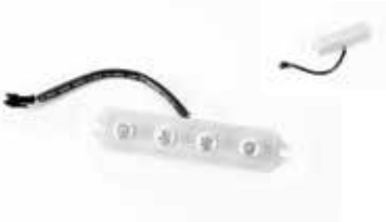
Replacement Switch Panel To Suit Camec 12 Volt Range Hood - refer code 040864

Replacement switch panel to suit Camec 12v range hood 040864