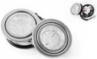
Replacement Led Down Light Short Lead (PCB Side) To Suit Camec 12 Volt Range Hood - refer code 040864

Replacement LED down light with short lead(PCB side) to suit Camec 12v range hood 040864 each