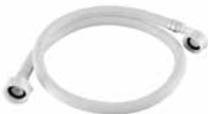
Replacement/ Spare Inlet Hose Part Id 80 041923