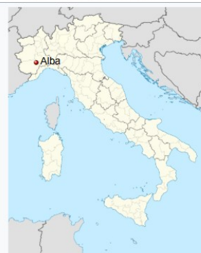
Location of Alba in Italy