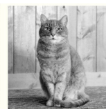
Gris The Boss - Tasting Room Cat