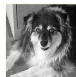
Ginger Winery and Vineyard Dog

PRODUCED & BOTTLED BY DOMAINE DE LA TERRE ROUGE, PETTSMOUTH, CALIFORNIA. ALC. 14.5% BY VOL.