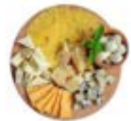
Mild and soft cheese