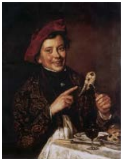
Alexis Soyer, painted by his wife

This fruit is sourced from three vineyards in Napa Valley; one in Oakville, owned by the Pelissa family that is grown organically, one interesting new property in Chiles valley and the other from a valley floor vineyard in the Yountville AVA. They were hand-picked between September 17 and October 20, 2017. We inoculated the must immediately after crushing and open top fermented the juice in small tanks. The wine was pumped over four times a day and then racked into center of France oak barrels, of which 25% were new and the balance were second and third use, for the malolactic fermentation. The wine was made with zero micro-oxygenation. The wine was aged in the barrels for 12-16 months depending on the lot. It was bottled without fining or filtration. 1232 cases produced.