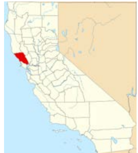
Sonoma County, California

The prominence of the California wine industry and Sonoma County in particular has established worldwide recognition of their wine regions. The Russian River Valley AVA lies adjacent to and west of the city of Santa Rosa and incorporates the southern reach of the Russian River, where the river bends westward and cuts through the Coast Range to the Pacific Ocean. The AVA is characterized by the regular intrusion of cooling fog from the coast. The fog flows through the Petaluma Wind Gap and the channel cut by the river. The fog generally arrives in the evening or early morning and retreats before noon in the day. The appellation was granted AVA status in 1983 and accounts for about one-sixth of the total planted vineyard acreage in Sonoma County. In 2005 the AVA was expanded by 30,200 acres (122 km 2 ) to 126,600 by recognizing previously overlooked portions of the fog regions. Presently the Russian River AVA includes more than 15,000 acres (61 km 2 ) planted to wine grapes. At last count, 79 wineries were listed in the Russian River Valley Winegrowers website. The area is known for its success with cool climate varieties, notably Pinot noir and Chardonnay.