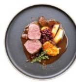
Game (deer, venison)