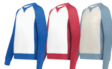
ROYAL HEATHER/ WHITE 58N