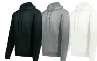
ONYX HEATHER 146