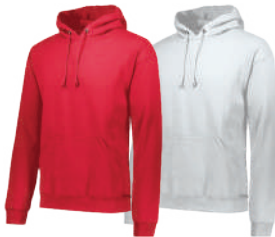
TRUE RED EP3