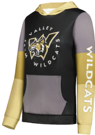
Color Block III