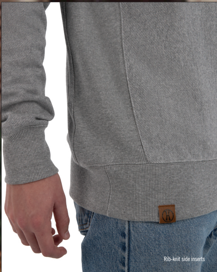
Rib-knit side inserts