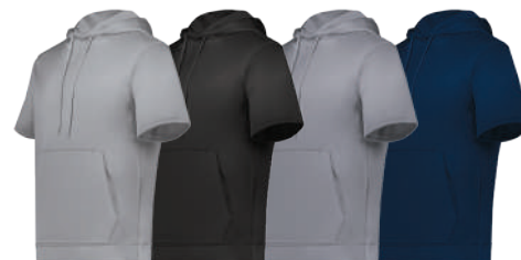
ATHLETIC GREY 009