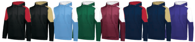
BLACK/ SCARLET 500