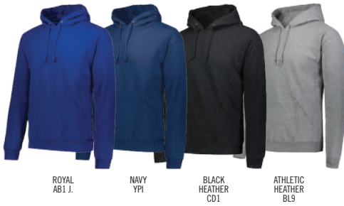
ROYAL AB1 J.