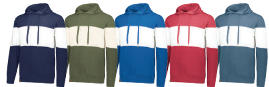
NAVY HEATHER/ WHITE 57N