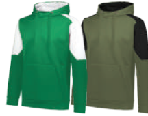
KELLY/ WHITE 340