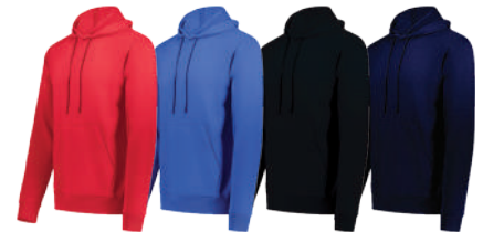
CHERRY RED 085