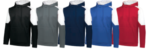
BLACK/ WHITE 420