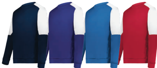
NAVY/ WHITE 301