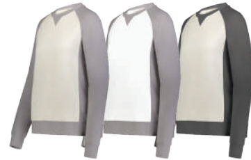
ATHLETIC GREY HEATHER/BIRCH 982