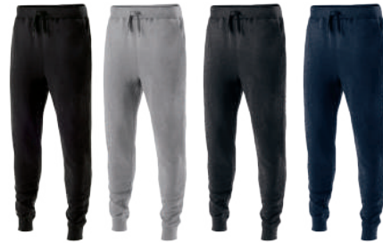
BLACK 080 CHARCOAL HEATHER 017 CARBON HEATHER E83 NAVY 065