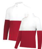
223500 223600 223700 Momentum Team 1/2 Zip Pullover