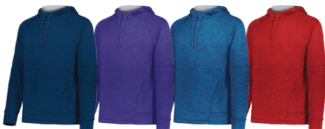
NAVY HEATHER/ SILVER 107