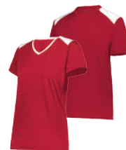
223501 223601 223701 Momentum Team Tee