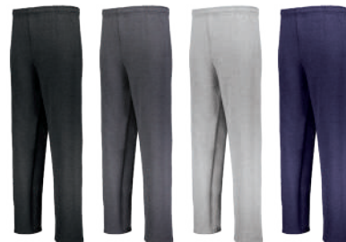
BLACK BLK BLACK HEATHER GW8 OXFORD OXF J. NAVY QZB