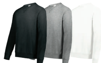
ONYX HEATHER 146