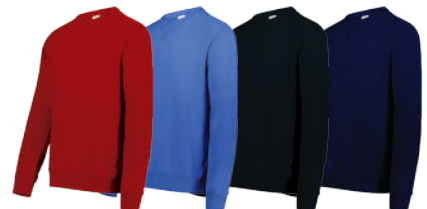
CHERRY RED 085