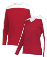
223502 223602 223702 Momentum Team Long Sleeve Tee