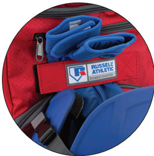
Hook and loop strip closure for batting gloves