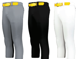
BASEBALL GREY BG7