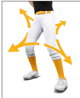
4-Way stretch properties allow for increased mobility