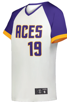
All Over 2.0