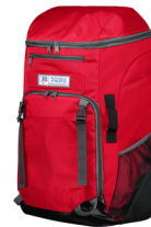
TRUE RED TRR