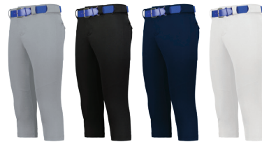
BASEBALL GREY BG7