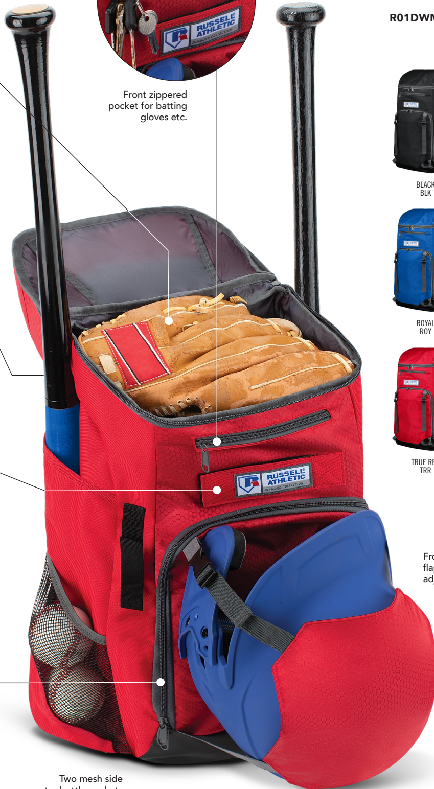
Two mesh side water bottle pockets