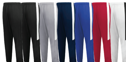
BLACK/BLACK 425 BLACK/WHITE 420 GRAPHITE/WHITE R04 NAVY/WHITE 301 ROYAL/WHITE 280 SCARLET/WHITE 408 WHITE/BLACK 226