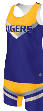
Diagonal Color Block