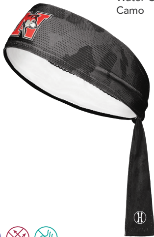
Water Color Camo