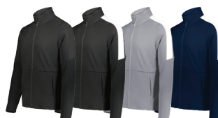
BLACK/BLACK 425 BLACK/WHITE 420 GRAPHITE/WHITE R04 NAVY/WHITE 301