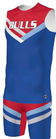
Diagonal Color Block