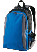
Without mesh ball holder

Reinforced, multi-use side pouch pockets with bat straps