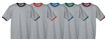
ATHLETIC HEATHER/ BLACK 158 ATHLETIC HEATHER/ RED 154 ATHLETIC HEATHER/ ROYAL 156 ATHLETIC HEATHER/ D. GREEN 153 ATHLETIC HEATHER/ MAROON 155