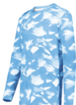
COORDINATING LONG SLEEVE TEE 222597 | 222697