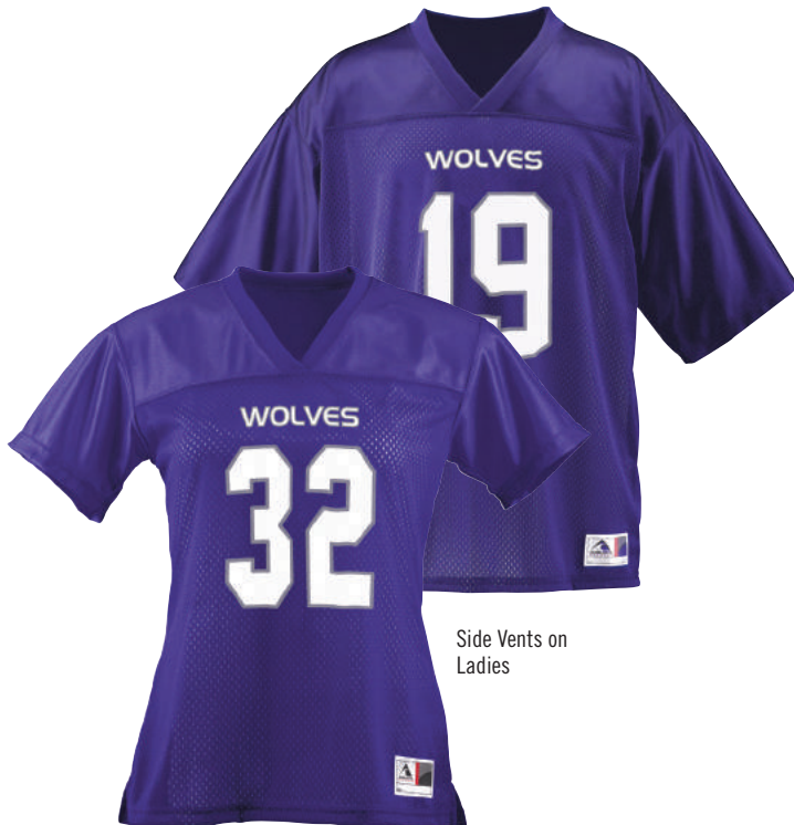
Side Vents on Ladies