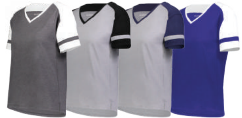
CARBON HEATHER/WHITE 99E