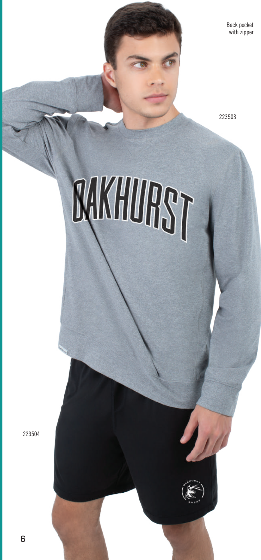
Back pocket with zipper