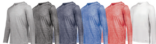
ATHLETIC GREY HEATHER 55M