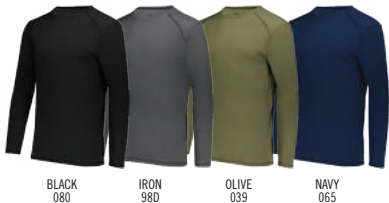
BLACK 080 IRON 98D OLIVE 039 NAVY 065