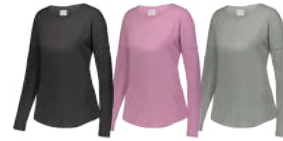
BLACK/HEATHER K94 DUSTY ROSE/HEATHER 73N GREY/HEATHER 013