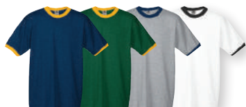
NAVY/ GOLD 302 DARK GREEN/ GOLD 442 ATHLETIC HEATHER/ NAVY 157 WHITE/ BLACK 226