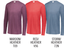
MAROON/HEATHER T09 RED/HEATHER V96 STORM/HEATHER 72N