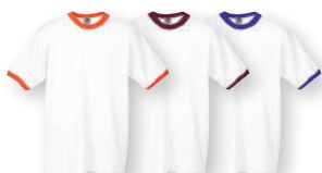
WHITE/ ORANGE 227 WHITE/ MAROON 224 WHITE/ PURPLE 231