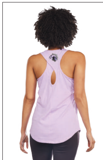
Racerback with keyhole