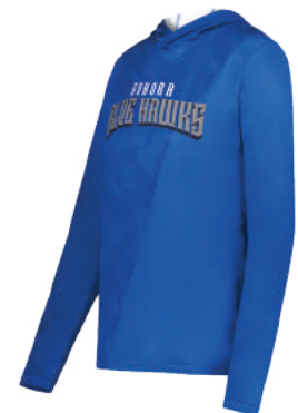
Watercolor Camo II