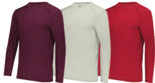
MAROON 45 OYSTER 53T SCARLET 083