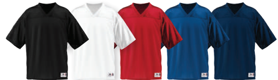
BLACK 080 WHITE 005 RED 040 ROYAL 060 NAVY 065