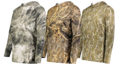
MO ELEMENTS WAKEFORM GALE 88T