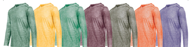
DARK GREEN HEATHER V97