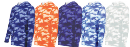
GLACIER NAVY 84V GLACIER ORANGE 83V GLACIER PURPLE 82V GLACIER ROYAL 81V GLACIER SILVER 80V