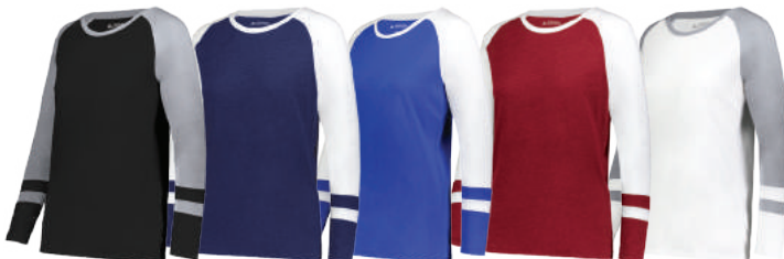
BLACK/ GREY HEATHER 92T