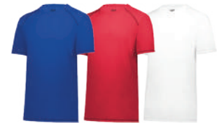
ROYAL 060 SCARLET 083 WHITE 005