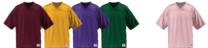
MAROON 045 GOLD 025 PURPLE 050 DARK GREEN 035 LIGHT PINK 095