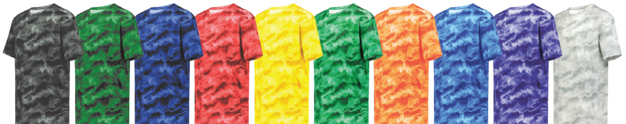
SHOCKWAVE GRAPHITE 66V