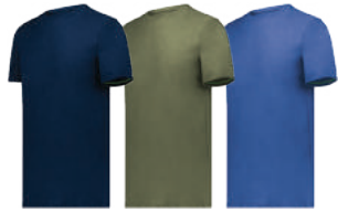
NAVY HEATHER U22