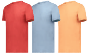
SCARLET HEATHER T20