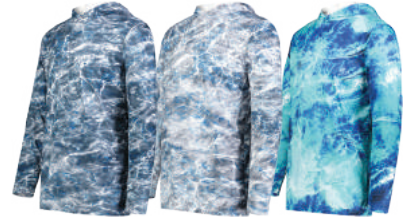
MO ELEMENTS AGUA BLACKFIN 86T