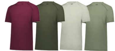
MAROON 745 OLIVE 039 OYSTER 53T CELERY 54T