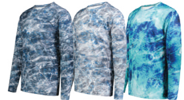
MO ELEMENTS AGUA BLACKFIN 86T