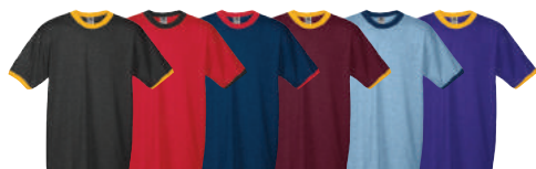
BLACK/ GOLD 421 RED/ BLACK 407 NAVY/ RED 307 MAROON/ GOLD 389 LIGHT BLUE/ NAVY 461 PURPLE/ GOLD 495