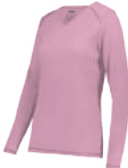
DUSTY ROSE 23D