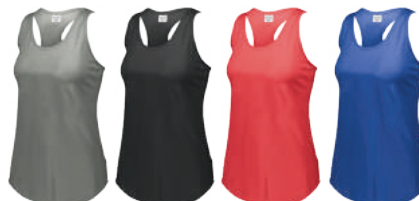
GREY HEATHER 013