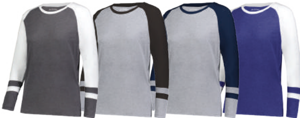
CARBON HEATHER/ WHITE 99E