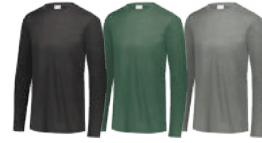
BLACK/HEATHER K94 DARK GREEN/HEATHER V97 GREY/HEATHER 013