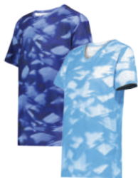
COORDINATING TEES 222596 | 222696 | 222796