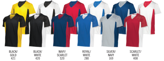
BLACK/GOLD 421 BLACK/WHITE 420 NAVY/SCARLET S20 ROYAL/WHITE 280 SILVER/NAVY 169 SCARLET/WHITE 408