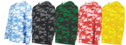
GLACIER COL BLUE 76V GLACIER BLACK 87V GLACIER DK GREEN 88V GLACIER SCARLET 86V GLACIER GOLD 85V