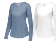
STORM/HEATHER 72N WHITE 005