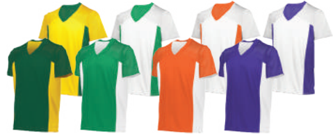
DARK GREEN/GOLD 442 KELLY/WHITE 340 ORANGE/WHITE 320 PURPLE/WHITE 450