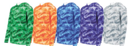
SHOCKWAVE KELLY 72V SHOCKWAVE ORANGE 73V SHOCKWAVE ROYAL 75V SHOCKWAVE PURPLE 74V SHOCKWAVE SILVER 77V