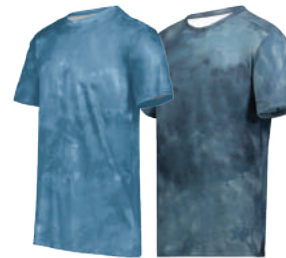
COL BLUE CLOUD PRINT 67T