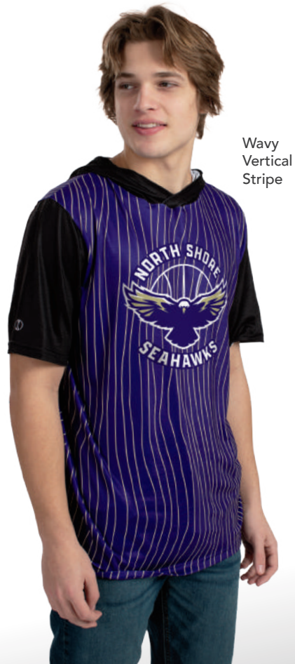
Wavy Vertical Stripe