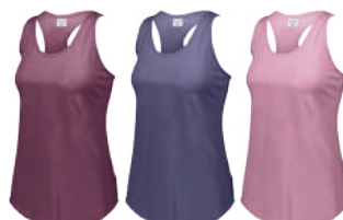
MAROON HEATHER T09