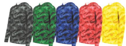
SHOCKWAVE GRAPHITE 86V SHOCKWAVE DK GREEN 87V SHOCKWAVE NAVY 88V SHOCKWAVE SCARLET 70V SHOCKWAVE GOLD 71V