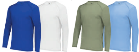
ROYAL 060 WHITE 005 CELERY 54T LAKE 55T