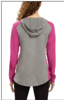
Dropped tail on Ladies