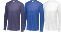
NAVY/HEATHER U22 ROYAL/HEATHER U55 WHITE 005