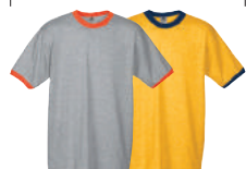
ATHLETIC HEATHER/ ORANGE 188 GOLD/ NAVY 241