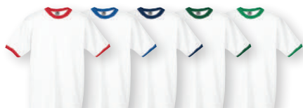
WHITE/ RED 225 WHITE/ ROYAL 220 WHITE/ NAVY 221 WHITE/ DARK GREEN 232 WHITE/ KELLY 222