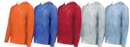
ORANGE CLOUD PRINT 68T ROYAL CLOUD PRINT 63T SCARLET CLOUD PRINT 66T SILVER CLOUD PRINT 69T STORM CLOUD PRINT 70T