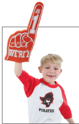
Available in Toddler (422)