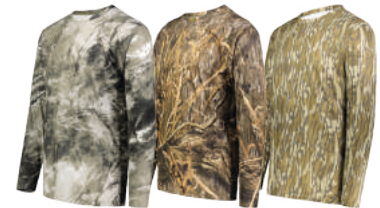
MO ELEMENTS WAKEFORM GALE 88T