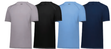
ATHLETIC GREY 009 BLACK 080 LAKE 55T NAVY 065