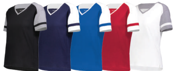
BLACK/GREY HEATHER 92T