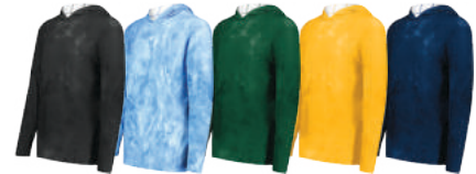
BLACK CLOUD PRINT 65T COL BLUE CLOUD PRINT 67T DK GREEN CLOUD PRINT 62T GOLD CLOUD PRINT 61T NAVY CLOUD PRINT 64T