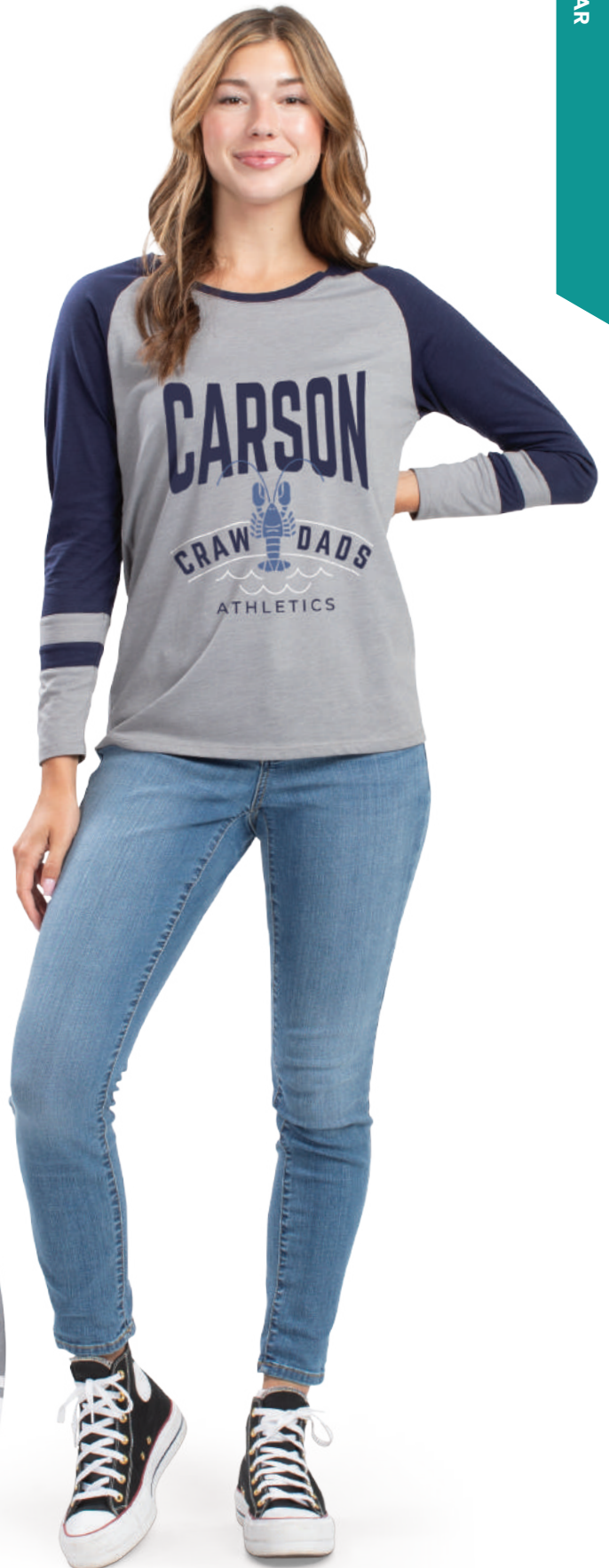
WHITE/ GREY HEATHER 91T