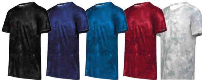
BLACK CLOUD PRINT 65T