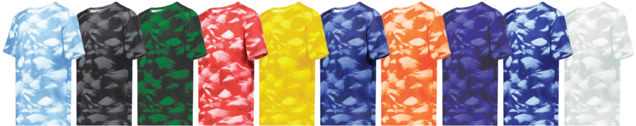
GLACIER COL BLUE 76V