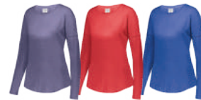
NAVY/HEATHER U22 RED/HEATHER V96 ROYAL/HEATHER U55