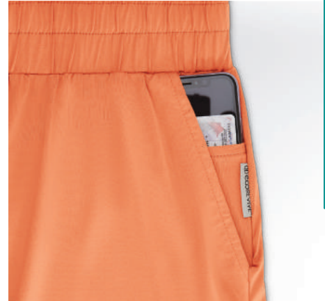
Front pockets with inner valuables pocket inside left pocket