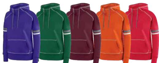
PURPLE/ WHITE/ GRAPHITE 696