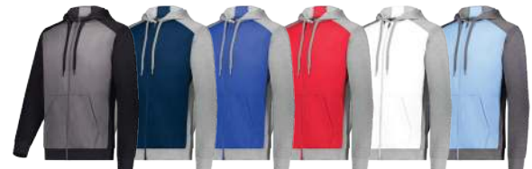
CARBON HEATHER/ BLACK F39