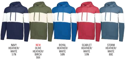
NAVY HEATHER/ WHITE 57N