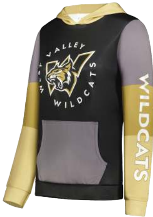
Color Block III