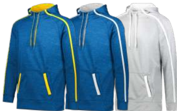
ROYAL/ GOLD 281