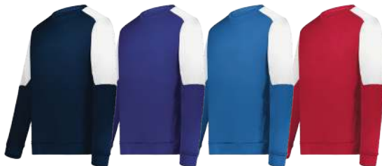
NAVY/ WHITE 301