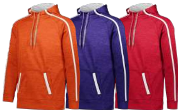
ORANGE/ WHITE 320