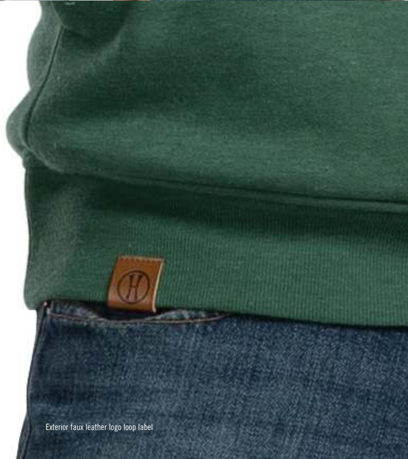
Exterior faux leather logo loop label