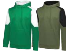
KELLY/ WHITE 340