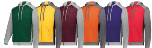
DK GREEN/ GREY HEATHER W25