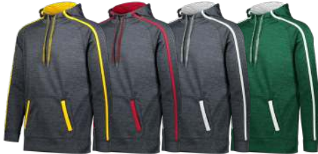
BLACK/ GOLD 421