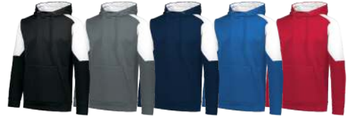
BLACK/ WHITE 420