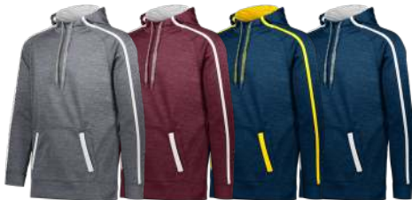
GRAPHITE/ WHITE R04