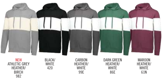
NEW ATHLETIC GREY HEATHER/ BIRCH 982