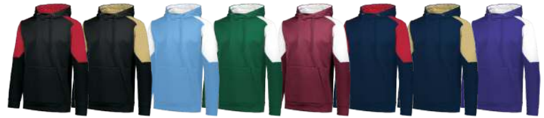
BLACK/ SCARLET 500