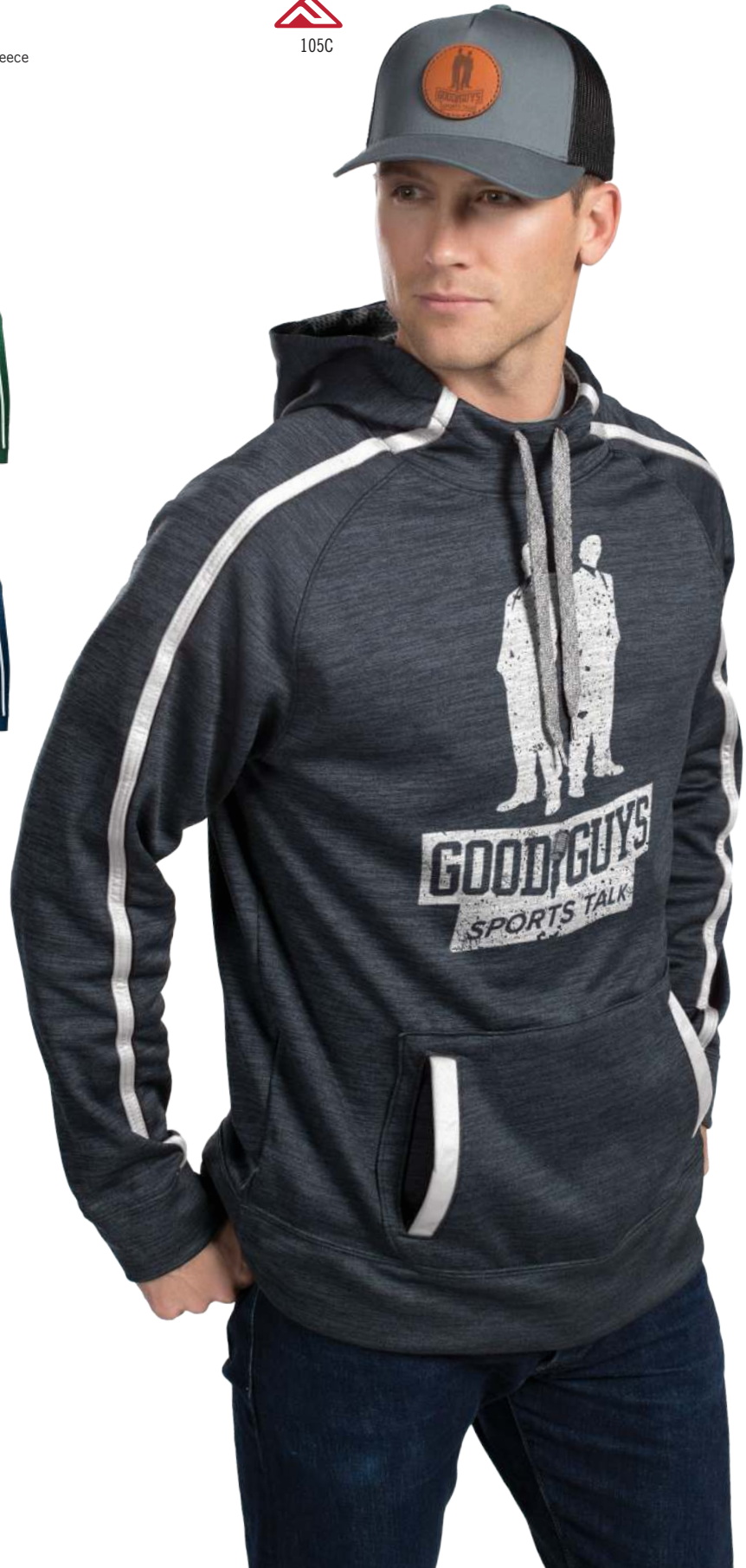
SILVER/ WHITE 254