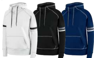
WHITE/ BLACK/ GRAPHITE X26