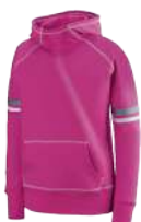
POWER PINK/ WHITE/ GRAPHITE G20