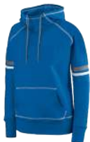
ROYAL/ WHITE/ GRAPHITE 191