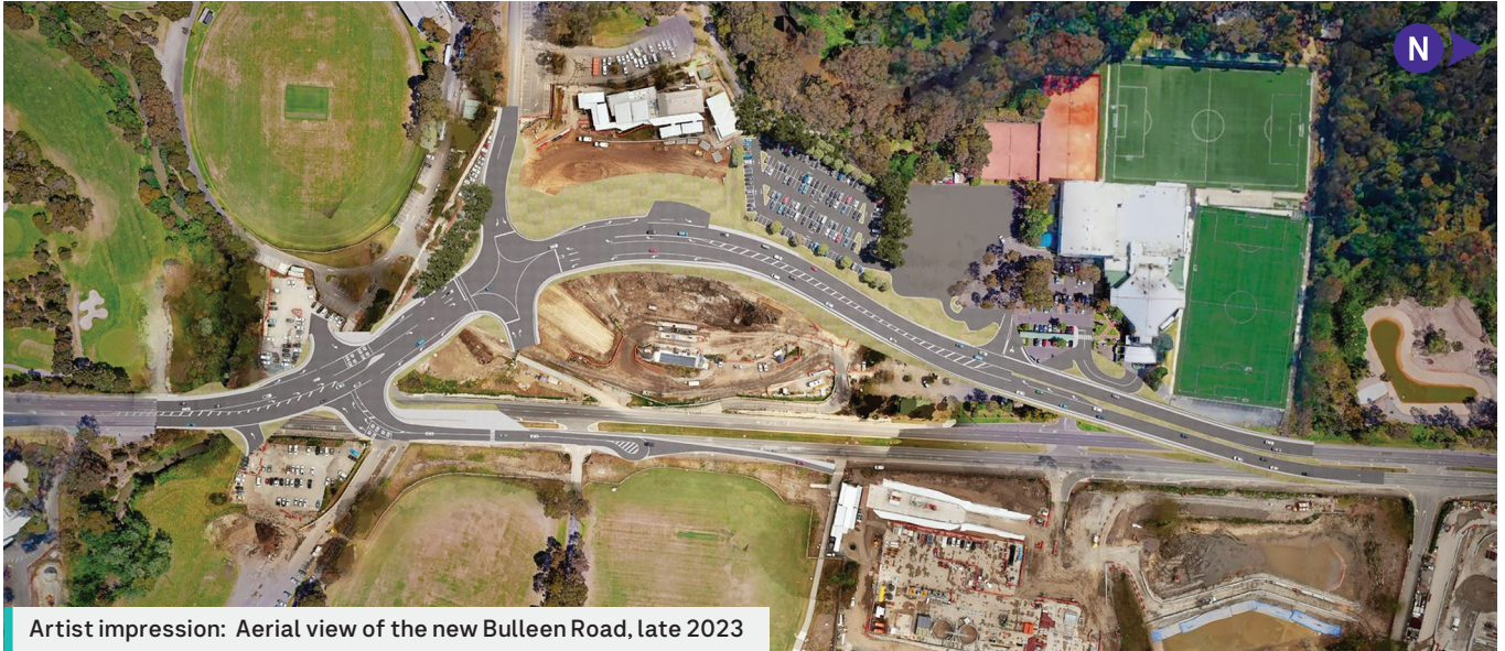
Artist impression: Aerial view of the new Bulleen Road, late 2023