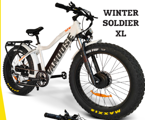
WINTER SOLDIER XL