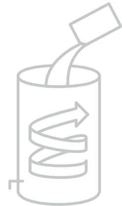
Pour WildBrew™ Helveticus Pitch into unhopped wort