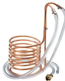
Immersion Wort Chiller

Go to www.brewersbestkits.com to find a retailer near you.