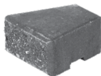
Tight Radius Unit