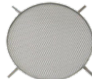
25" Spark Arrestor