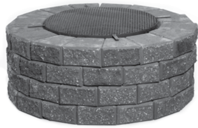
StackStone Fire Pit