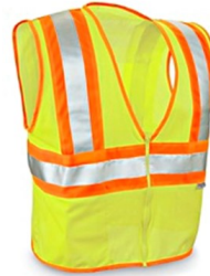
SV210P Class II Reflec- tive Tape, Inside Pocket Orange Trim, Zipper

Available in a variety of other styles and colors