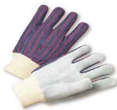
Economy Leather Palm, Red/Blue

Gloves available in a variety of other styles and colors