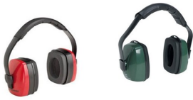
Gateway Safety Sound out High-Level Earmuffs & Mid-Level NRR Ear Muff