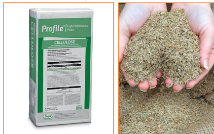
Profile Cellulose Paper Mulch & Seeds