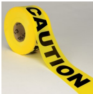
Yellow, 2 Mil, 3" x 1000' Polyethylene Caution Tape

Available in a variety of other styles and colors