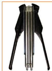
Hog Ring Pliers