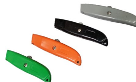
Easy Slide & Lock Utility Knives

Sunglasses available in a variety of other styles and colors.