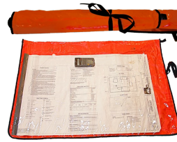
Size: 41" x 29"