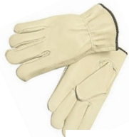
Seattle Glove 4364, Un- lined B Grade Grain Drivers, Keystone

Gloves available in a variety of other styles and colors