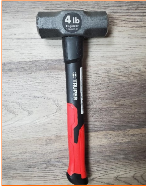
Sledge Hammer 4 lb.