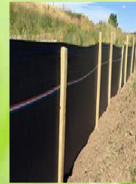
Silt Fence with Wood Stakes