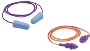
Gateway GloPlugz® Tapered Earplugs