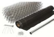
Field Wire & Welded Wire Mesh Rolls Available