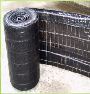
Wire Back Silt Fence