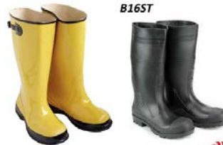
Seattle Boots 16" Black Waterproof PVC Steel Toe

Available in a variety of other styles and colors