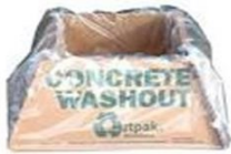
Comes in a variety of sizes