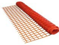
Orange or Green

Light / Medium Weight & Heavy Duty Woven