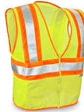
SV210P Class II Reflective Tape, Inside Pocket Orange Trim, Zipper Enclo- sure

Available in a variety of other styles and colors