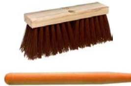
Requires standard tapered handle, not included

Wide flare allows close sweeping to curbs