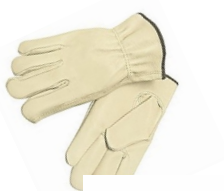
Seattle Glove 4364, Un- lined B Grade Grain Drivers, Keystone