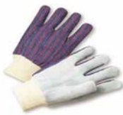
Economy Leather Palm, Red/Blue Stripes

Available in a variety of other styles and colors