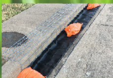
Curb Inlet Protection

281-717-8921 www.siltmanagementsupplies.com