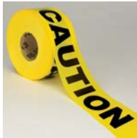
Yellow, 2 mil, 3" X 1000' Polyethylene Caution Tape

Available in a variety of other styles and colors