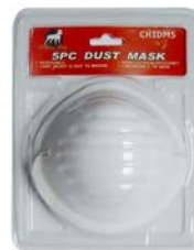
5 PC Dust Mask- disposa- ble, lightweight, easy to breathe, comfortable, good filtering efficiency