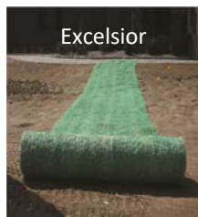
Single Sided, 4' x 180'

Curlex Excelsior Blankets are specifically designed to help control soil erosion, preserve the soil & promote ideal growing conditions for grass seed, protecting topsoil from wind & water erosion.