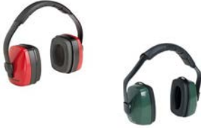
Gateway Safety Sound out High-Level Ear- muffs & Mid-Level NRR Ear Muff