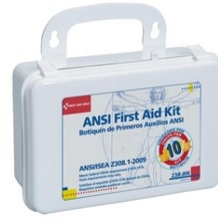
10 Person & 25 Person 2009 ANSI/OSHA, "Easy Care" First Aid Kit, w/ Eyewash