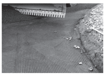
Placing Geogrid to accommodate curves.