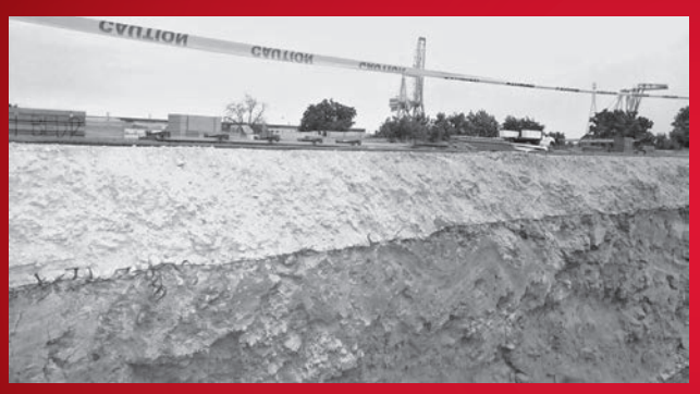
A backhoe excavation through Tensar Geogrid.