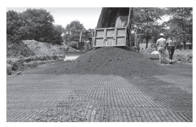
End dumping aggregate fill on top of Tensar Geogrid over soft subgrade.