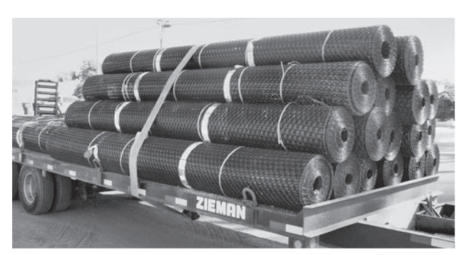
Storing the Tensar Geogrid rolls horizontally.