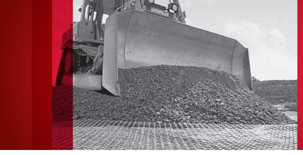
Dumping aggregate fill on top of Tensar® Geogrid over competent subgrade.