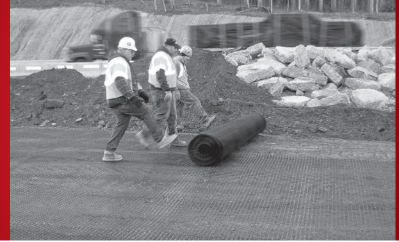
Rolling out Tensar® Geogrid.