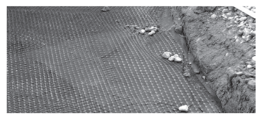
Anchoring geogrid with piles of aggregate.