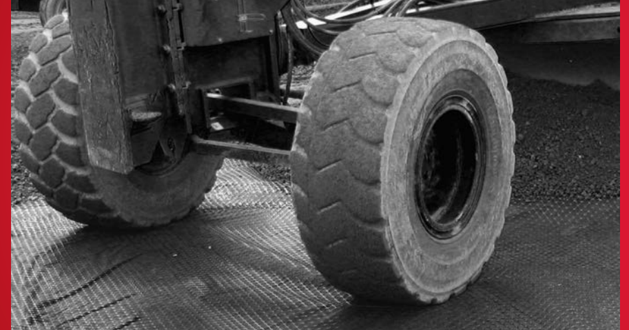
Geogrid can be trafficked directly by rubber-tired equipment.