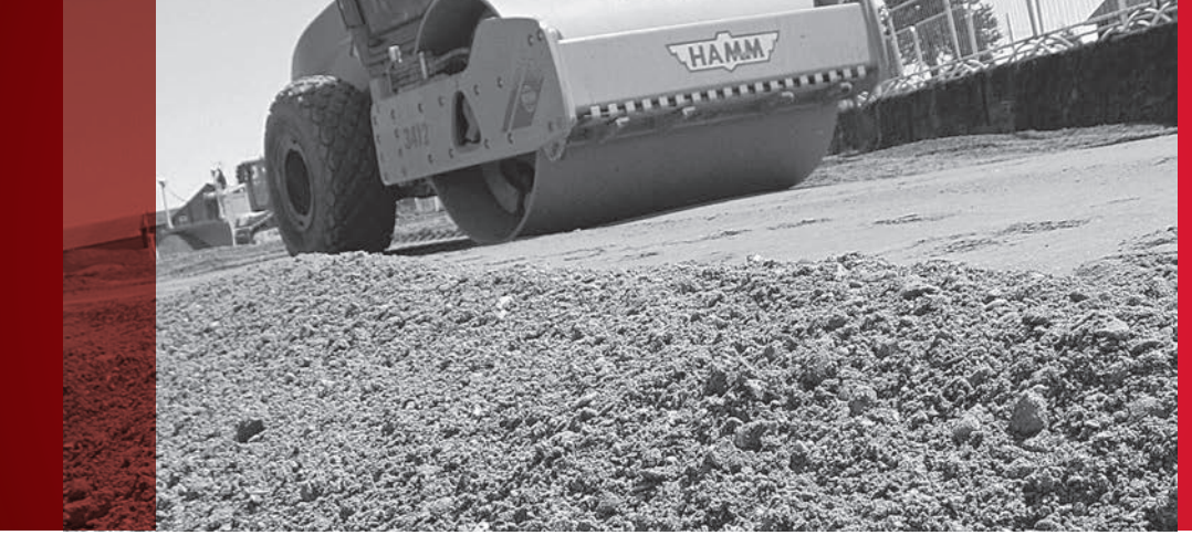
Compacting the aggregate fill.