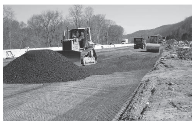
Spreading aggregate fill over Tensar Geogrid.