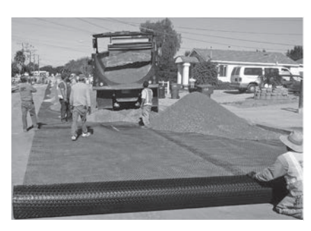
Geogrid should overlap in the direction of advancing fill.