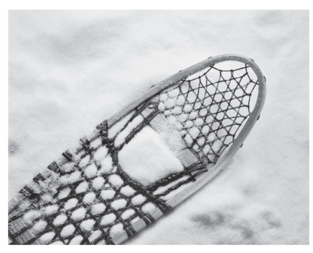
The Snowshoe Effect - Tensar TriAx Geogrids distribute heavy loads over soft soils just like a snowshoe supports the weight of a man over soft snow.

*This guide cannot account for every possible construction scenario, but it does cover most applications. If you have questions regarding a specific project, call 800-TENSAR-1 or visit www.TensarCorp.com.