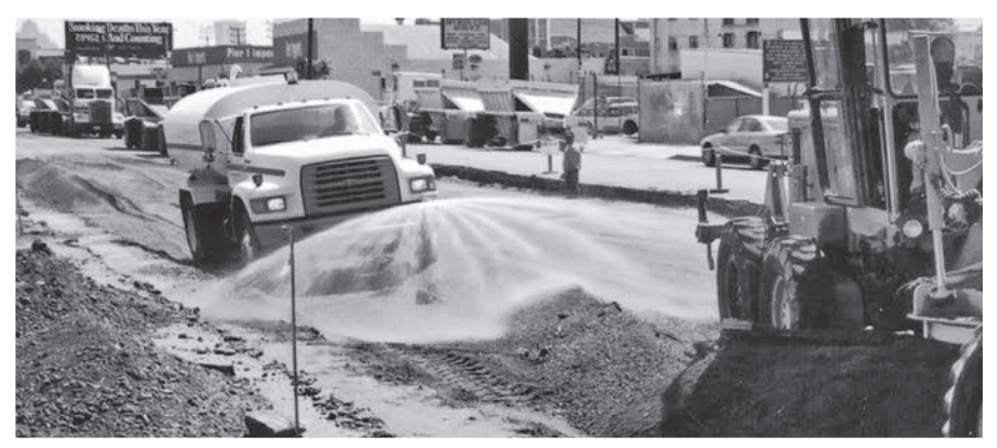
Moistening the fill before compaction.