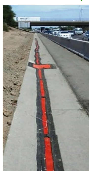
Slot Guard used in conjunction with two GR8 Guard units. Three Slot Guard units are overlapped on a long slot drain.