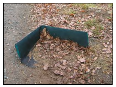
Velocity check for ditch or channel