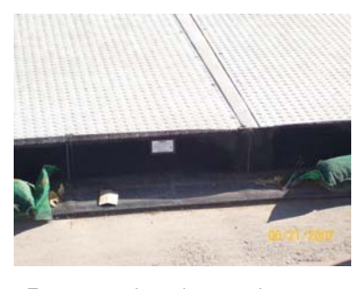
Easy to monitor, clean, and remove.

Application: Drain Inlet Protection — Home Building