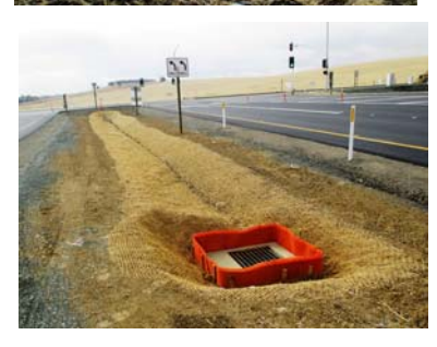
Minimization of off-site sediment loss is achieved with a combination of BMPs. Here and erosion control blanket is used in combination with Drop Guard.