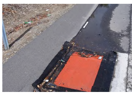
Early in the project

GR8 Guard™ is a patent pending, low cost system designed to keep sediment and debris out of grated storm drain inlets in paved areas. The berm layer forces water to rise to at least 1.5 inches before reaching the filter causing heavier particles to settle. The system filters storm water above the ground easing visual inspection and maintenance. The system has a high flow bypass designed to reduce the chance of back ups. It is easy to fasten to the grate with rebar tie-wire, has a long life, is resistant to traffic, and reusable. Grates do need to be removed, during installation or cleaning, reducing installer injuries and worker's comp claims.