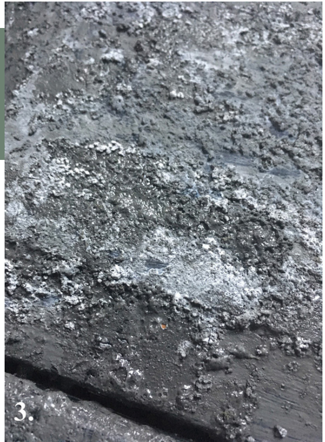
SEA SALT FIZZ drying and showing paint craters