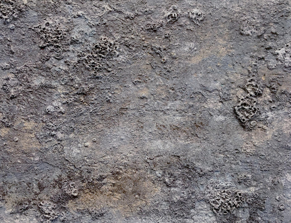
SEA SALT FIZZ dried and cured