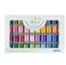
40-COLOUR EMBROIDERY THREAD SET SA740