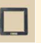
4"X4" MAGNETIC FRAME SAMFM100