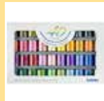
40-COLOUR EMBROIDERY THREAD SET SA740