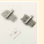
SPANISH HEMSTITCH FOOT SA220