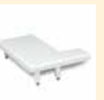
WIDE TABLE SAWT8