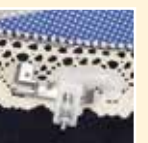
PEARL FOOT SA217

*On selected accessories. Separate purchase required.