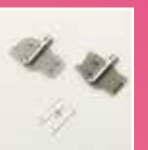
SPANISH HEMSTITCH FOOT SA220