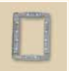
4"x7" MAGNETIC FRAME SAMF180N