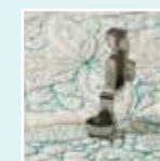
HIGH SHANK RULER FOOT SA218