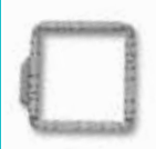
MAGNETIC FRAME 10" x 10" SAMS254