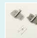
SPANISH HEMSTITCH FOOT SA220