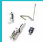
QUILT SET SAQKIT