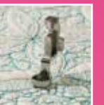
HIGH SHANK RULER FOOT SA218