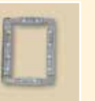
4"X7" MAGNETIC FRAME SAMF180N