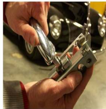
Fig. 2a Test fit shaft to latch