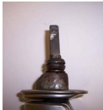
Fig. 2 File or sand shaft to size