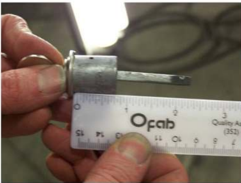
Fig. 7 Measure (Coupe)2 1/2" or (Tudor) 2 1/16" from base with no gasket. Mark and cut shaft. If you are using a gasket you will need to add the gasket thickness to the length of the shaft.