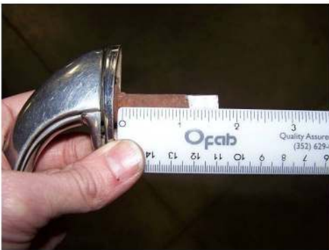
Fig. 1 Measure (Coupe)1 3/4" or (Tudor)1 7/16" from base with no gasket. Mark and cut shaft. If you are using a gasket you will need to add the gasket thickness to the length of the shaft.