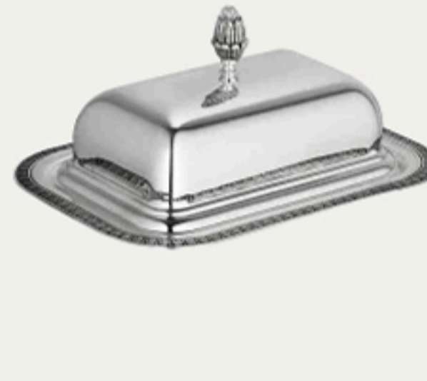
MALMAISON Silver-Plated Lidded Butter Dish