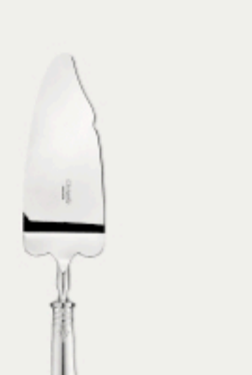
MALMAISON Silver-Plated Cake Server

“ Try keeping the florals Under 14” in height so guests can see over them. Also instead of one arrangement use many smaller vases filled with a single flower all in your favorite colors. Shades of pinks, all white, or blues Look fabulous running down the center of the table.