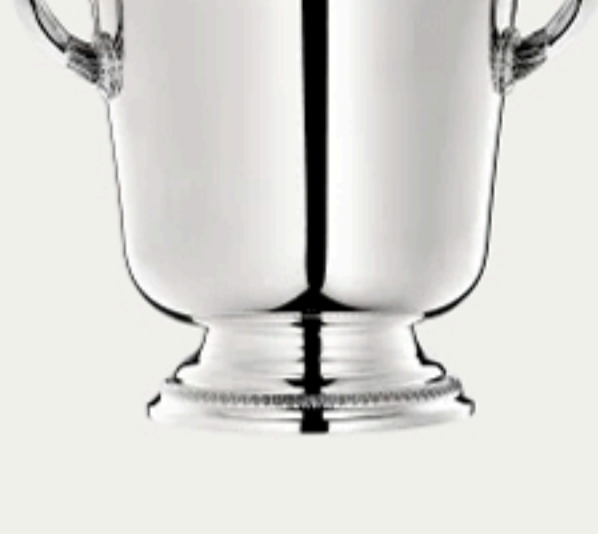
MALMAISON Silver-Plated Ice Bucket