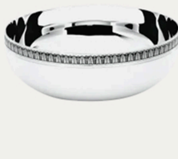
MALMAISON Silver-Plated Round Bowl, Small