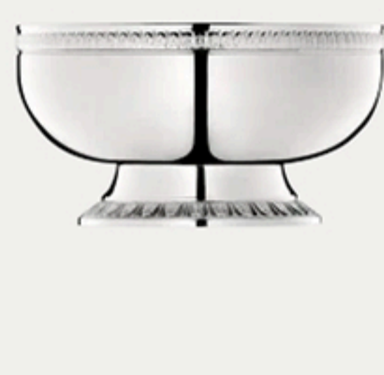
MALMAISON Silver-Plated Pedestal Bowl