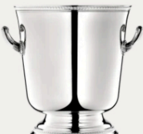
MALMAISON Silver-Plated Champagne Cooler Bucket