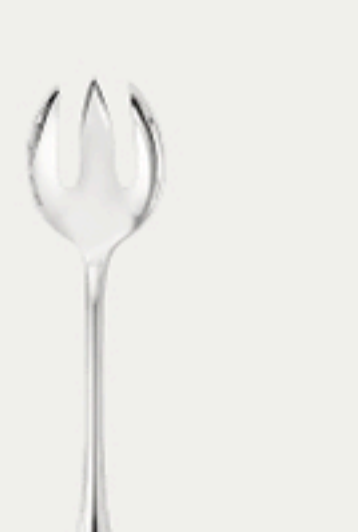
MALMAISON Silver-Plated Salad Serving Fork