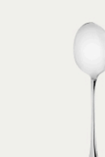
MALMAISON Silver-Plated Salad Serving Spoon