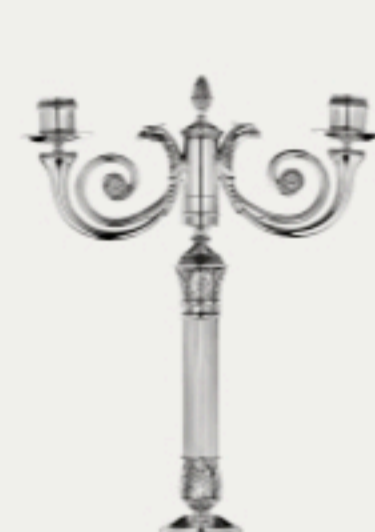
MALMAISON Silver-Plated Candelabra For Two Candles