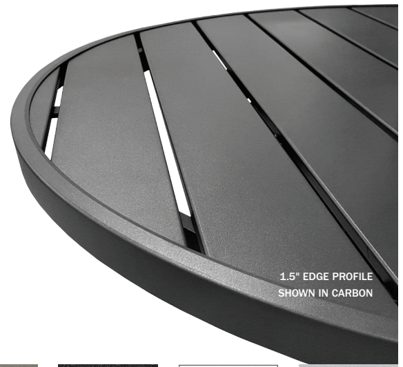
1.5" EDGE PROFILE SHOWN IN CARBON

Note: Use our lift kit (KIT175) to raise the 37XX series base on all Breeze dining tables an additional 1.75" in height, changing the table height from 27.5" (dining height) to 29.25" (café height).