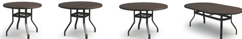
42" BAR 3042RBR (with Hole) H: 40" 48" BAR 3048RBR (with Hole) H: 40" 54" BAR 3054RBR (with Hole) H: 40" 42" x 82" BAR 304482BR (with Hole) H: 40"