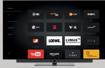
LOEWE. bild 3