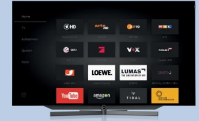
LOEWE. bild 7