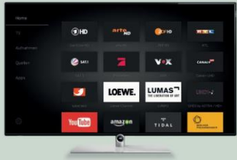
LOEWE. bild 1