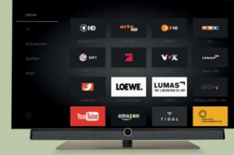
LOEWE. bild 5