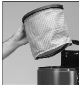
Remove cloth filter bag, clean, dust and replace.