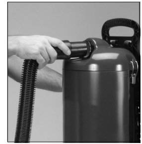
Remove vacuum hose from top of unit.