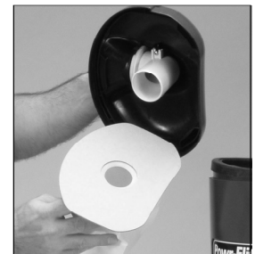
Insert new paper bag making sure to align lid nozzle with bag hole and replace latches.