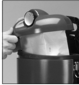
Release the two latches and lift off lid.