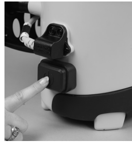
Turn off main power switch and unplug unit from wall outlet.