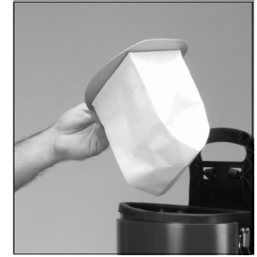
Separate lid from paper bag insert and dispose of paper bag.