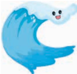
A: It waves!

How do we know that the ocean is friendly?