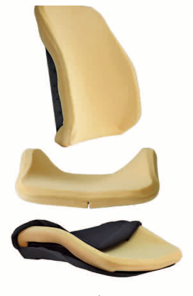
Cover and Foam Layers

✓ Hardware fits 3/4". 7/8" and 1" tubing and can be installed within a few minutes with the right tools