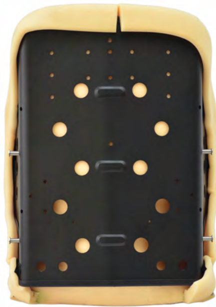
Back view of Foam Layer and Aluminum Shell