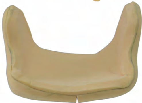
Max Ultra Back showing side and top view, of the back