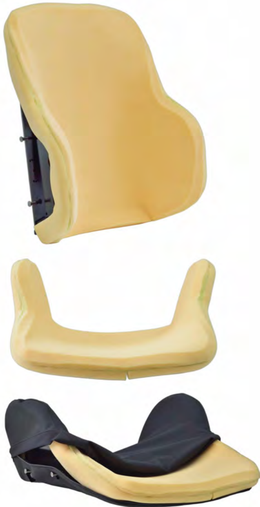
Cover and Foam Layers