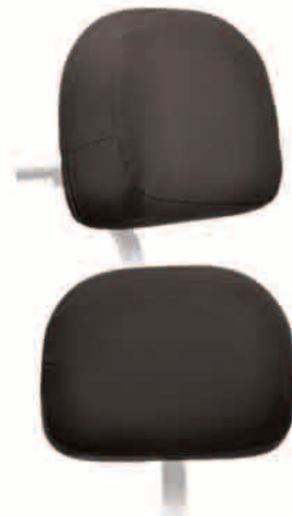
Large Headrest Foam Pad