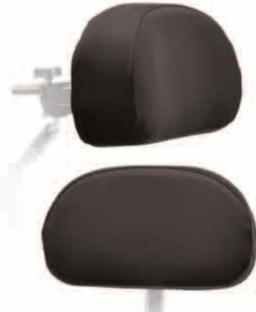
Medium Headrest Foam Pad