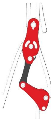
Engaged whilst lowering load

The Rigging Rope Wrench has been optimised for 13mm (1/2") rope making it the ultimate, lightweight rigging kit, when teamed with hollow-braids.