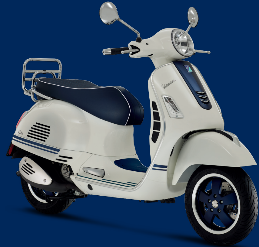
VESPA GTS YACHT CLUB