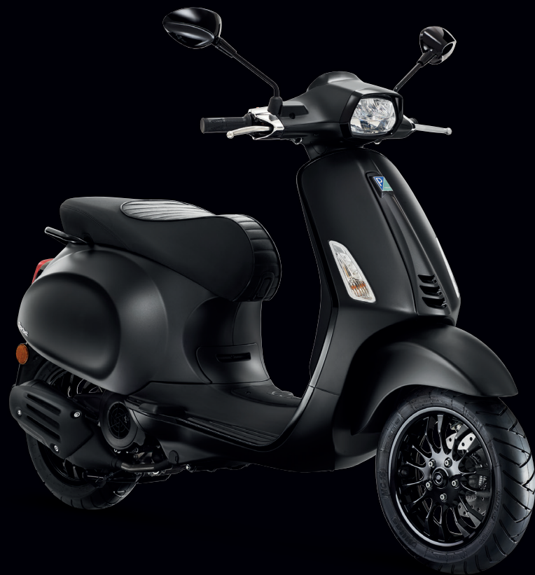
VESPA SPRINT NOTTE 50 / 150