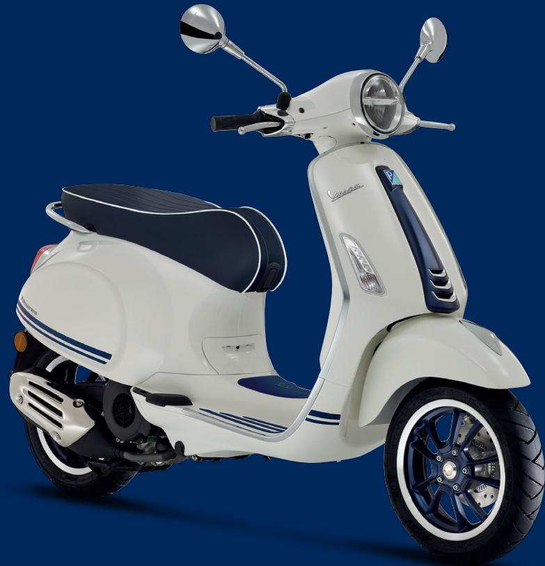
VESPA PRIMAVERA YACHT CLUB