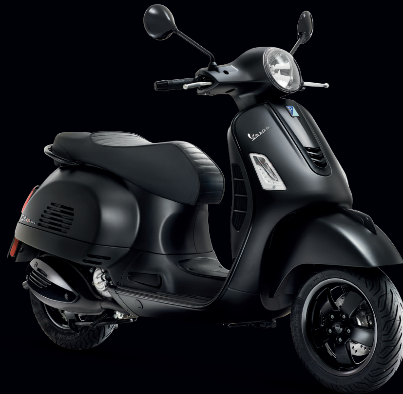
VESPA GTS SUPER NOTTE 300