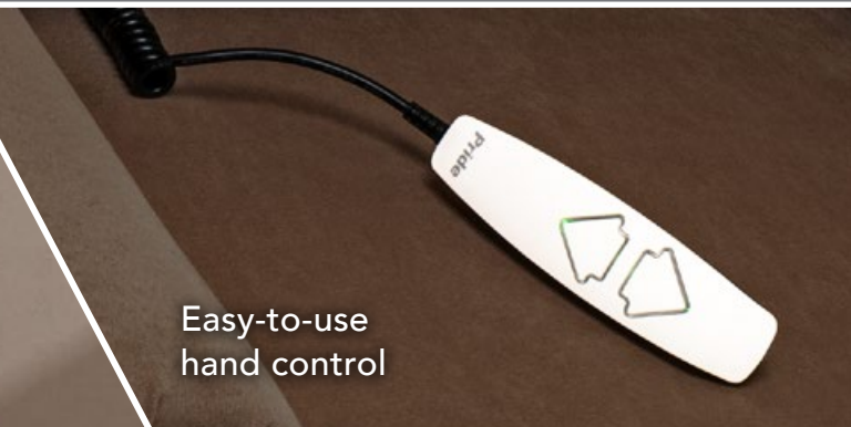
Easy-to-use hand control

ENERGY EFFICIENT WITH BUILT-IN BATTERY BACKUP