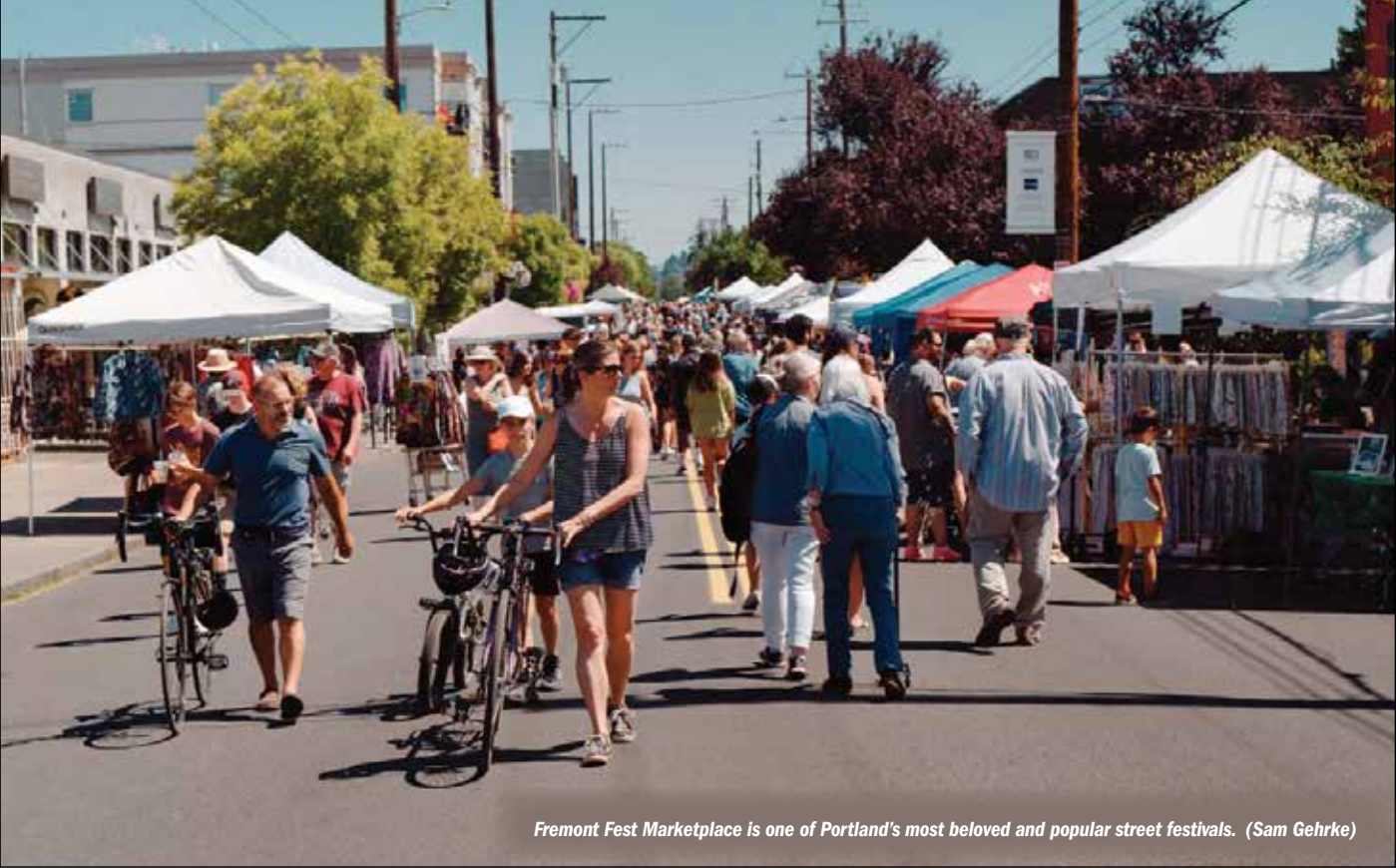
Fremont Fest Marketplace is one of Portland's most beloved and popular street festivals. (Sam Gehrke)