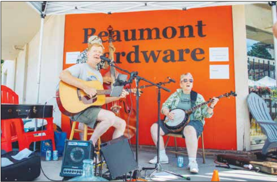
Enjoy live entertainment at venues along Northeast Fremont Street.

It's great." The fest spans Northeast Fremont Street from 42nd Avenue to 51st Avenue and this year's event promises even more fun in the sun. Visitors can enjoy the free Kid Zone located behind Wild Heart Wellness and Mathnasium, food trucks from throughout the city, discounts and prizes from their favorite shops, plus live music at McPeets, Tomorrow's Verse, and other venues along the street.