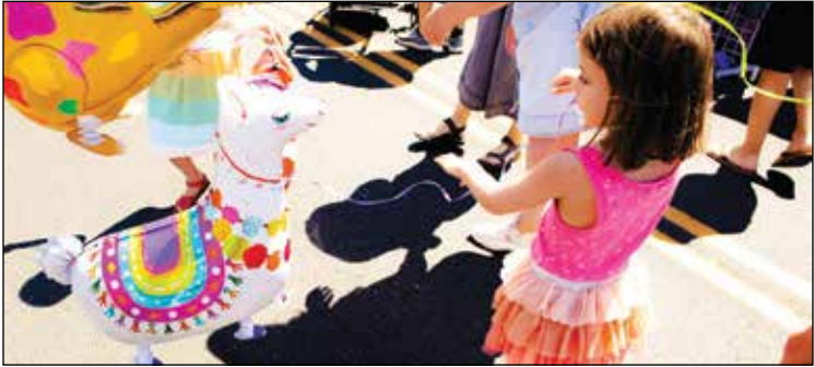
Above: The festival is a perennial favorite for kids of all ages.

Another new kid on the block is Nectar Frozen Yogurt Lounge, which opened its doors in Northeast Portland last month. Located at 4335 N.E. Fremont St., it promises the "freshest flavors in town," and is bound to be a crowd-pleaser on a hot summer day (or cold, rainy Portland day for that matter).